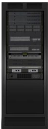
Competitor Solution: 20 Rack Units

To learn more about AMX and energy-saving AV solutions, please visit www.amx.com .