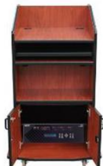
Enova DVX: 3 Rack Units